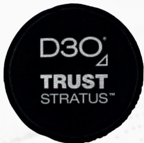
CROWN WITH LOGO