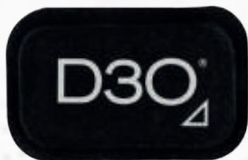
OBLONG WITH LOGO